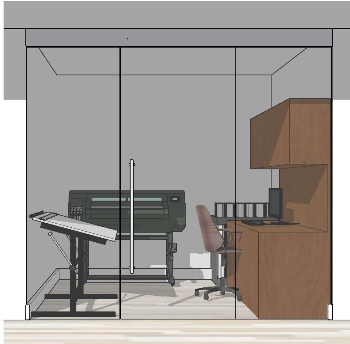
PERSPECTIVE VIEW Not Scaled