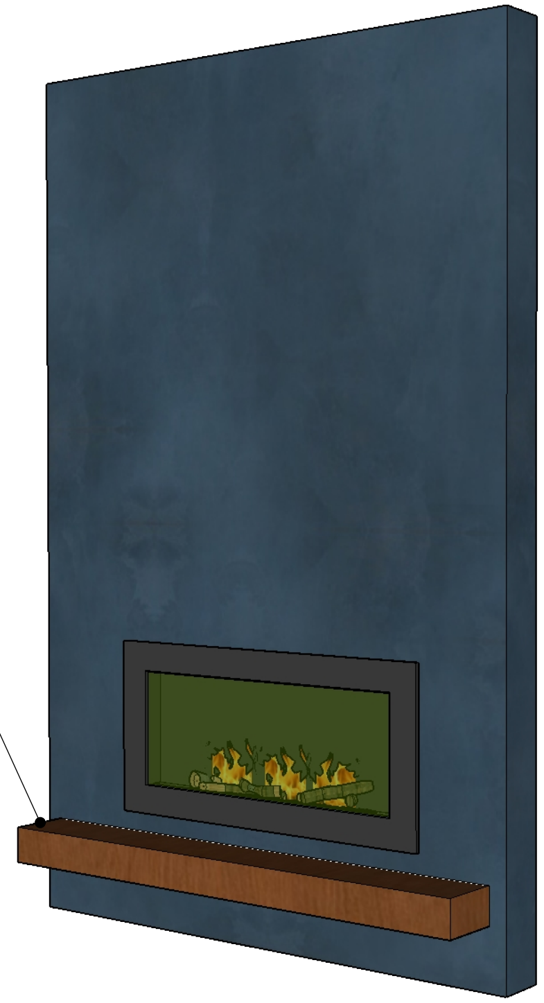
PERSPECTIVE VIEW Not Scaled

Drawings may not be scaled. The numerical dimensions represent correct measurements. All dimensions are given from finished floor and finished wall unless otherwise noted. All design ideas, drawings and plans represented here are owned by the property of WESTHAVEN CONSTRUCTION SERVICES. All rights reserved. Above suggested electrical and plumbing locations, must be verified in field.