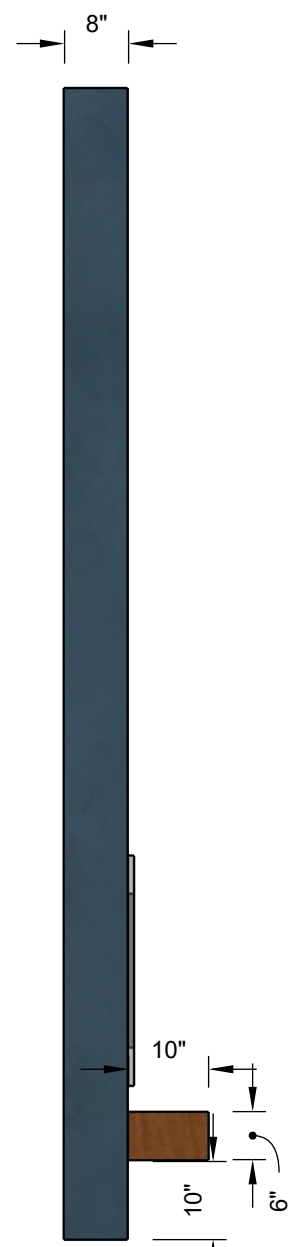
SIDE VIEW Scale 1:24