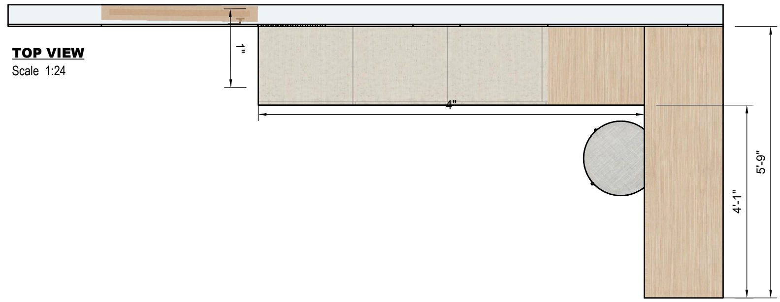
TOP VIEW Scale 1:24