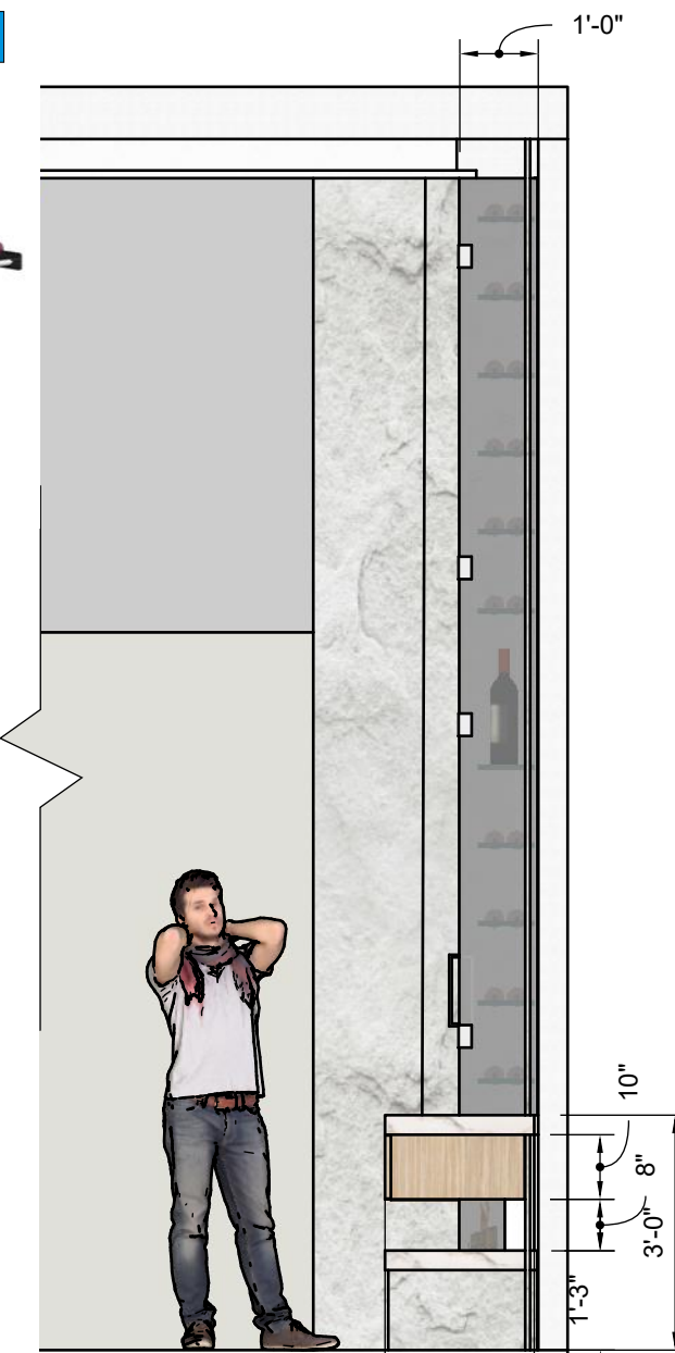
FRONT VIEW Scale 1:32