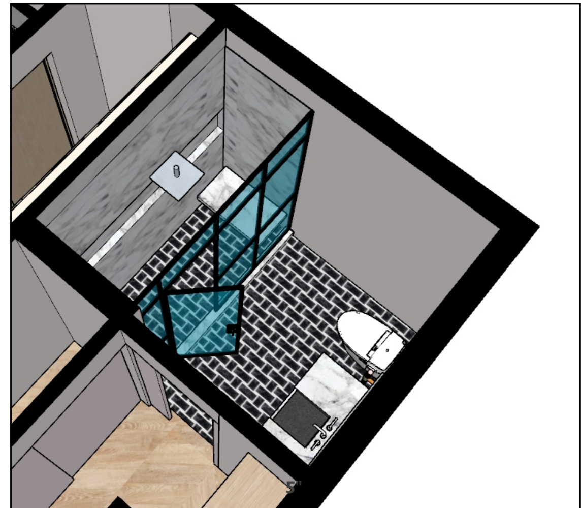
PERSPECTIVE VIEW Not Scaled

Drawings may not be scaled. The numerical dimensions represent correct measurements. All dimensions are given from finished floor and finished wall unless otherwise noted. All design ideas, drawings and plans represented here are owned by the property of WESTHAVEN CONSTRUCTION SERVICES . All rights reserved. Above suggested electrical and plumbing locations, must be verified in field.