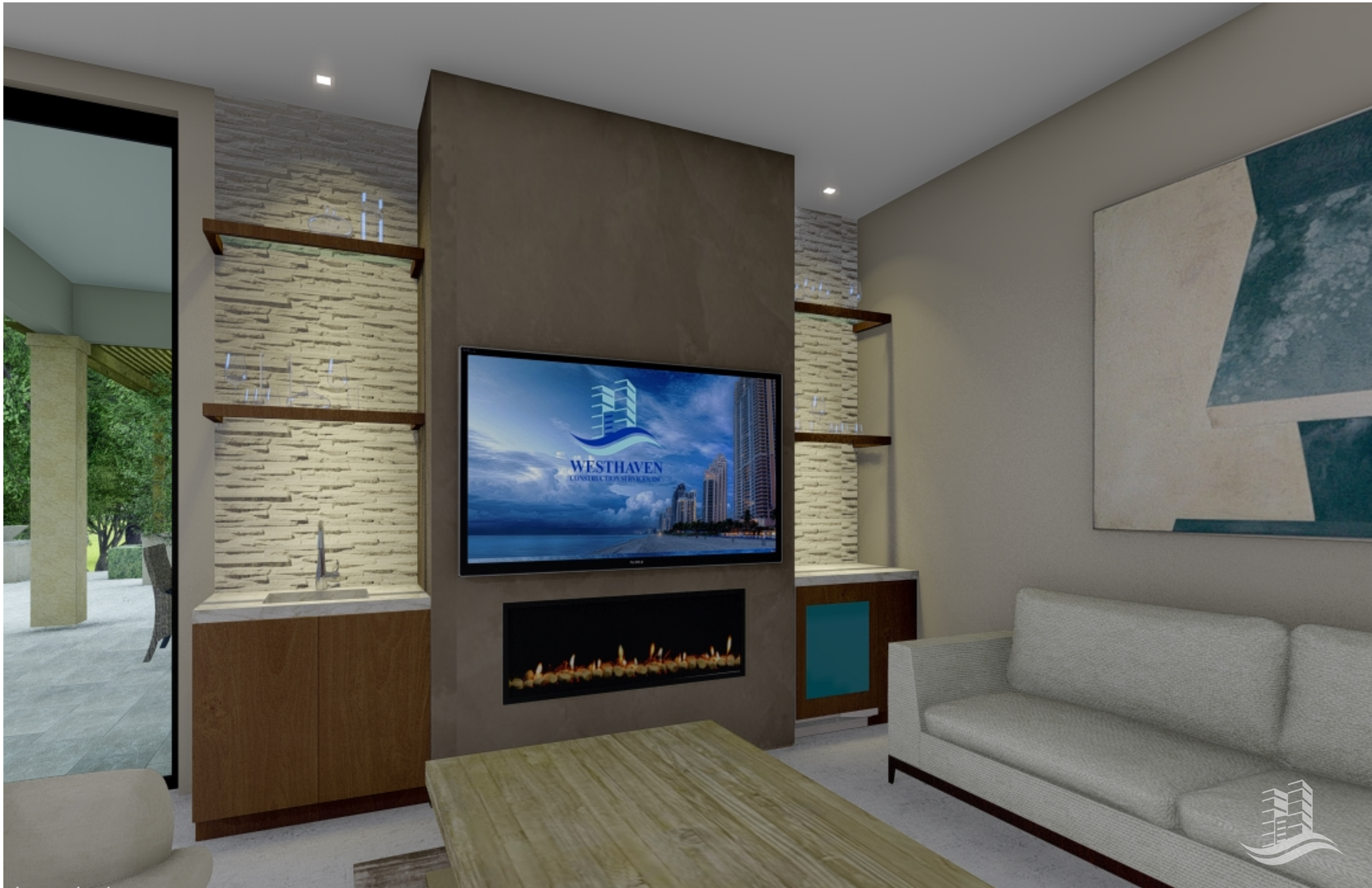
GREAT ROOM FIREPLACE