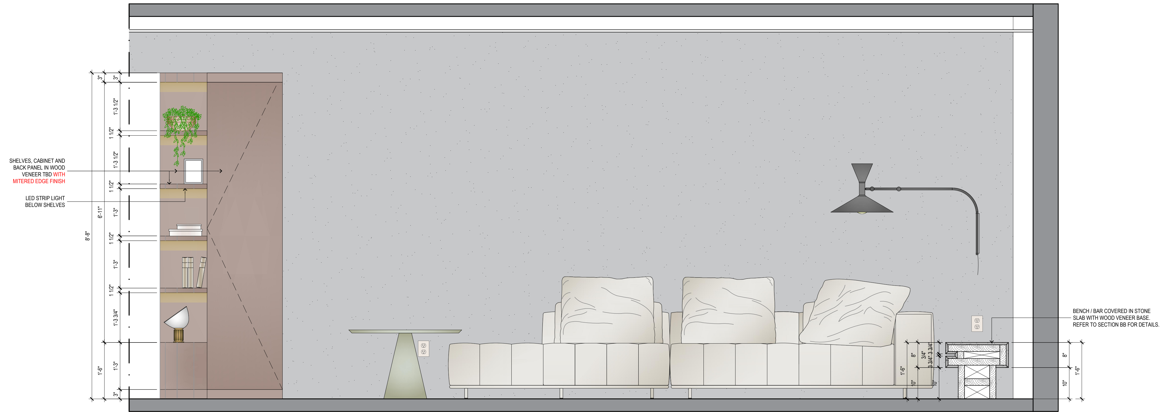
LIVING ROOM SECTION AA - MAIN WALL VIEW SCALE: 3/4" = 1' 0"