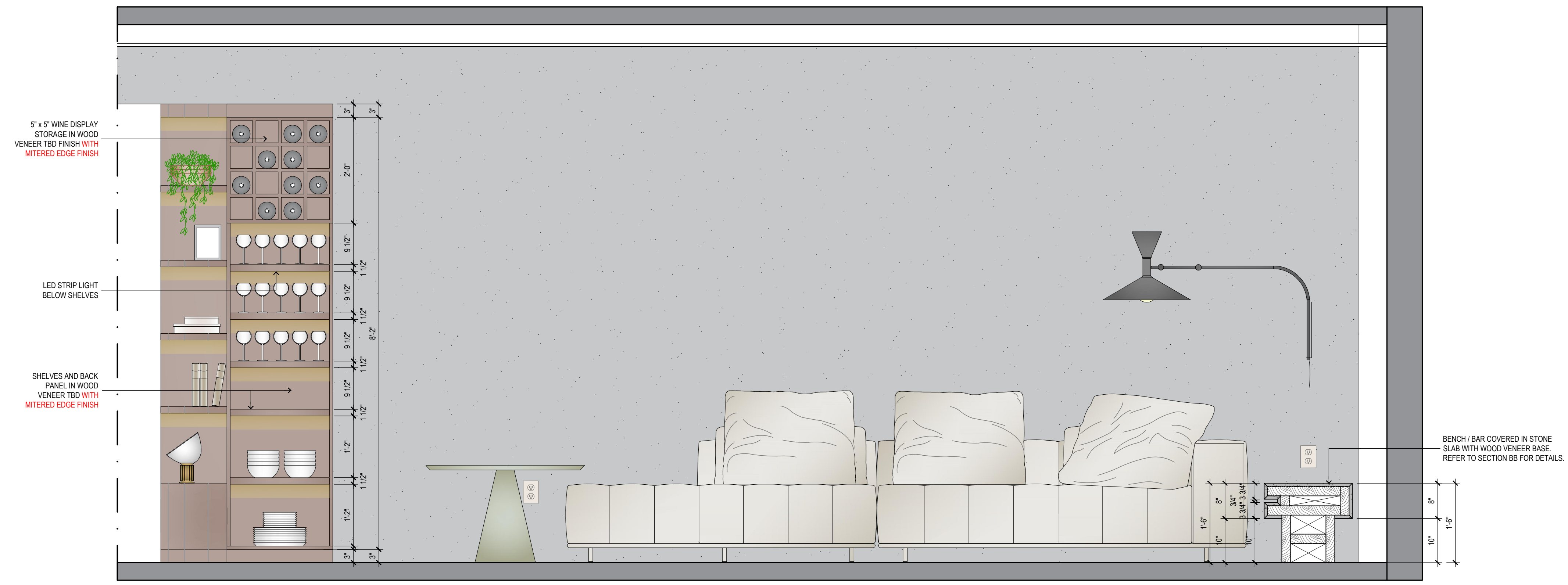
LIVING ROOM SECTION AA.1 - INTERIOR CABINET VIEW SCALE: 3/4" = 1' 0"

PROJECT NAME: SNYDER RESIDENCE ADDRESS: 100 South Pointe Dr. Miami Beach, FL 33139, South Tower #3606 ALL THE DIMENSIONS MUST BE CHECKED ON SITE